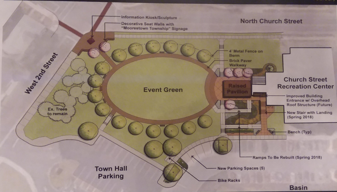
Potential Future Concept Plan - N.T.S.

Aerial Photograph courtesy of Google Earth obtained on or about August 25th, 2017