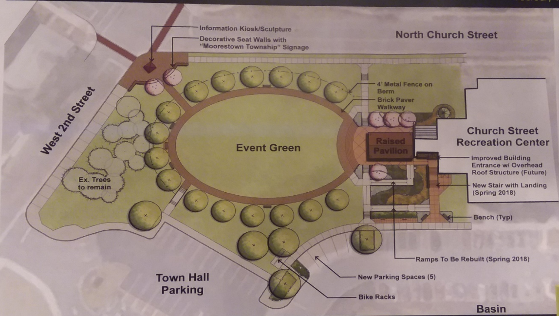
Potential Future Concept Plan - N.T.S.

Aerial Photograph courtesy of Google Earth obtained on or about August 25th, 2017