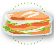
Ziploc & other reclosable food storage bags